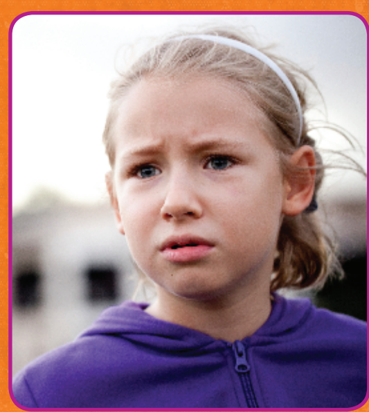
© Jani Bryson. © Pete Pahham. © holbox. © Patrick Foto. © Together. © pamspix © 2015 Lions Clubs International Foundation. All rights reserved.