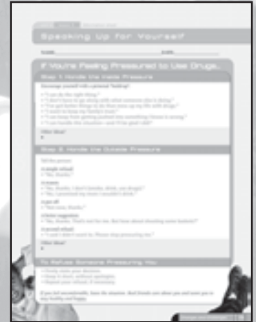
Speaking Up for Yourself , p. 131